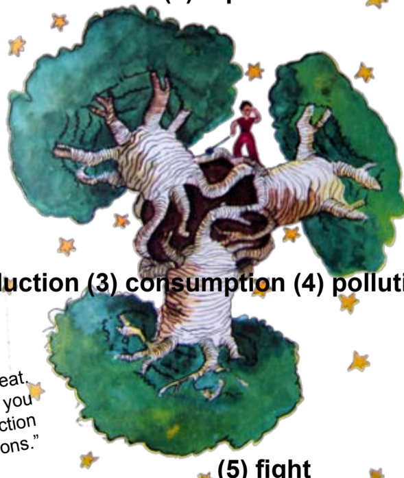
(2) production (3) consumption (4) pollution